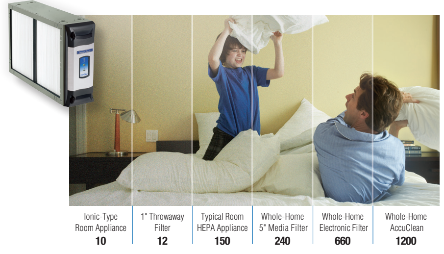
Ratings of cubic feet per minute of clean air delivered for a typical 3-ton heating and cooling system: the higher the value, the more effective the air cleaner.

Want 99.98% clean air? Then choose the home air filtration system that gives 110% - American Standard's revolutionary AccuClean.™ By removing up to 99.98% of unwanted allergens down to .1 micron from the filtered air, AccuClean is 100 times more effective than a standard 1" throwaway filter. Simply put, AccuClean works harder, so you and your family can breath easier.